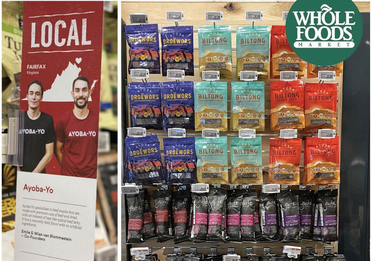
*Rebranded from Ayoba-Yo to Ayoba in April, 2020.