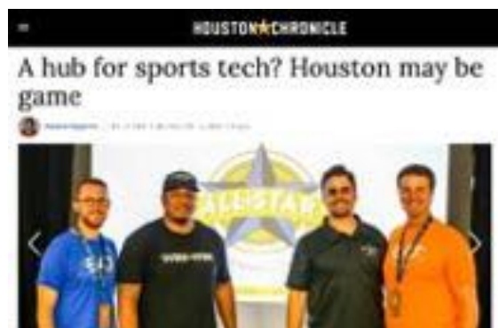
Founder & team

In March 2019, we finalized an exciting partnership deal with Cannon Ventures, which results in our relocation to Houston, TX in July 2019. Win-Win’s new home will be within the world’s largest tech co-working space in the world, a 120,000 square foot facility called The Cannon. The facility sits on a 32-acre entrepreneurial campus within Houston’s newly established “Founders District”.