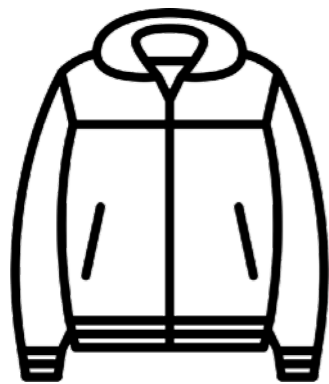
One-of-a-kind jacket (pre-made)

Get a one-of-a-kind jacket (pre-made) + invitation as VIP guest to all YeKim and celebrity events for 1 year + invitation to a YeKim photoshoot + everything above.