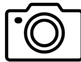
Invitation to a YeKim photoshoot